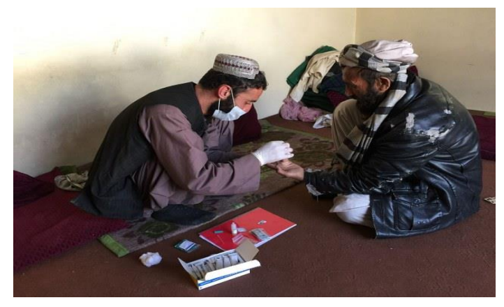
Figure 3: CBMM in Zabul Province-Health Post

The main challenge towards implementation of the project was instable -and even deteriorated- security situation, in both provinces, as for almost one quarter all HFs were closed by AOG in Zabul Province that after community negotiation and mediation the HFs reopened. Having effective risk mitigation plan and community support, ORCD succeeded to overcome the challenge and reach the target communities.