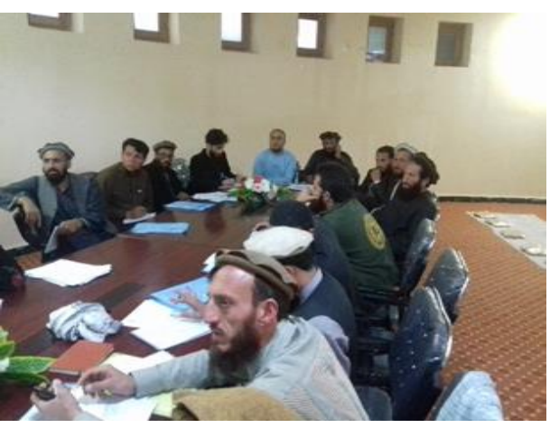
Figure 3 Rational Medicine use training