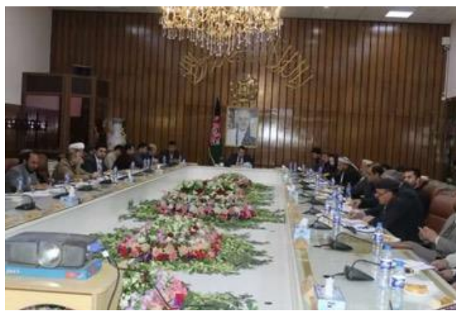
Figure 2: Provincial Reintegration committee meeting Balkh Province