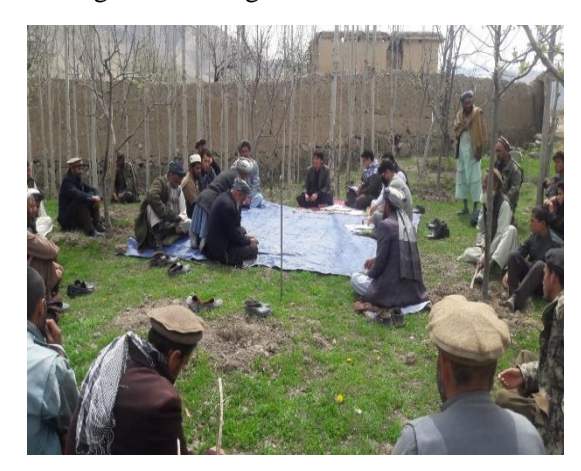
Figure 1: Establishing referral mechanism in Khushkak community

In partnership with IOM ORCD started Community Based Activities (Social and Psychosocial Aspects of Sustainable Reintegration) of RADA Project in Balkh Province. The overall Goal of the project is: To contribute to the progressive achievement of Sustainable Development Goal (SDG) 10.7, "to facilitate orderly, safe, regular, and responsible migration and mobility of people including through the implementation of planned and well-managed policies". The specific objective of the project is: To support Afghan returnees, their families and host communities towards sustainable reintegration in Afghanistan.