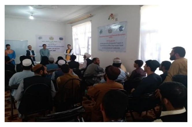
Figure 2 HMIS/IP Training in Farah Province