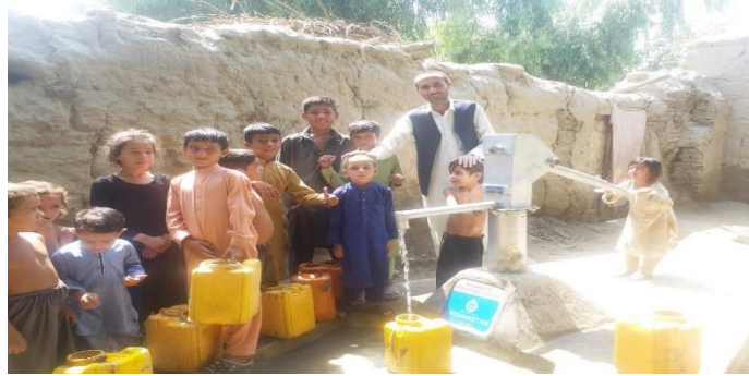
Figure 2 : Deep well constructed in Nangarhar province