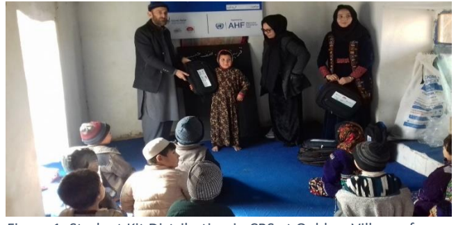
Figure 1: Student Kit Distribution in CBS at Qaldaw Village of Shortepa District of Balkh Province

The project established and supported 100 CBE classes facilitated by 100 teachers with priority to hire and train more female teachers (at least 60% female teacher). Through this project IRW and partners (ORCD, AGHCO, RET Germany) targeted around 200 villages where IDPs and