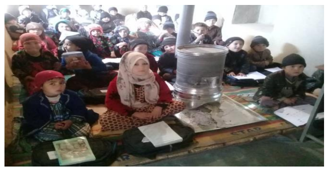
Figure 2 : CBE center at Shurtepa district of Balkh Province