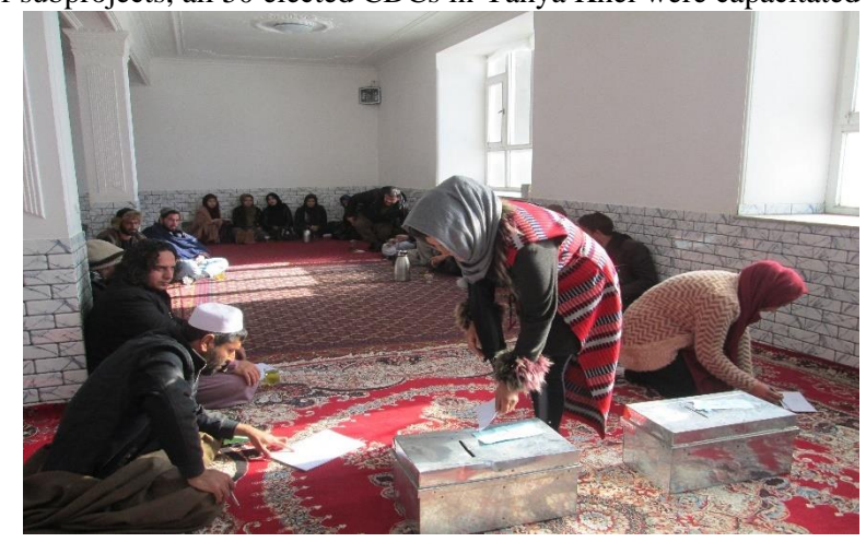
7Khuja Umari CCDCs election in Ghazni Province

Moreover, linkages of the elected Community Development Councils were built with District Governors, sectorial government departments. INGOs. NNGOs. Civil Societies and Youth Organizations at district and provincial level.