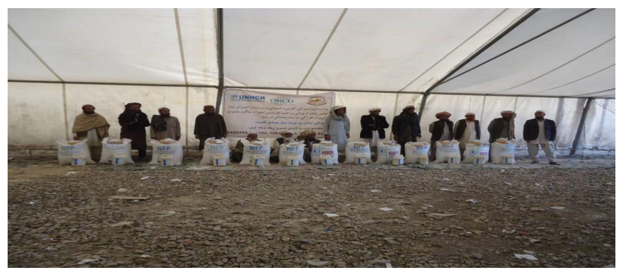
Beneficiaries receiving WFP food assistance in Barmal district of Paktika province

ORCD was responsible for offloading, warehouse management, repackaging, handling, crowd controlling, coordination with stakeholders, reporting to WFP and execution of distribution process of food items provided by WFP to direct target beneficiaries.