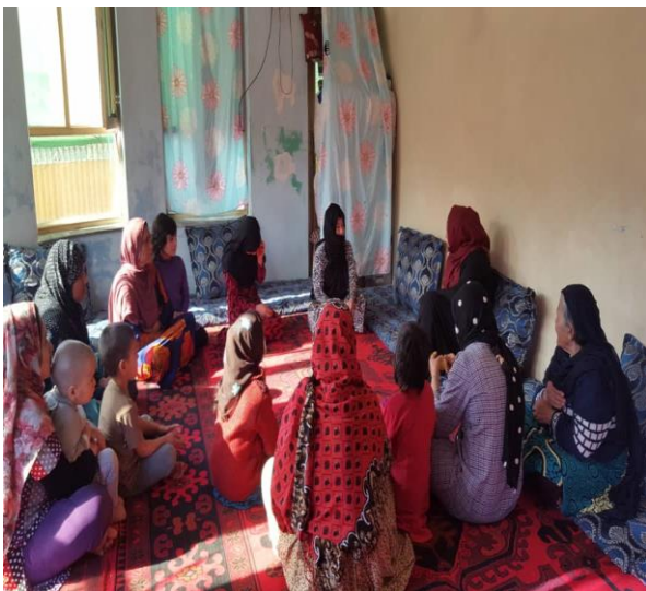
Figure 2 : Baghlan WPC defense lawyer delivering training to clients