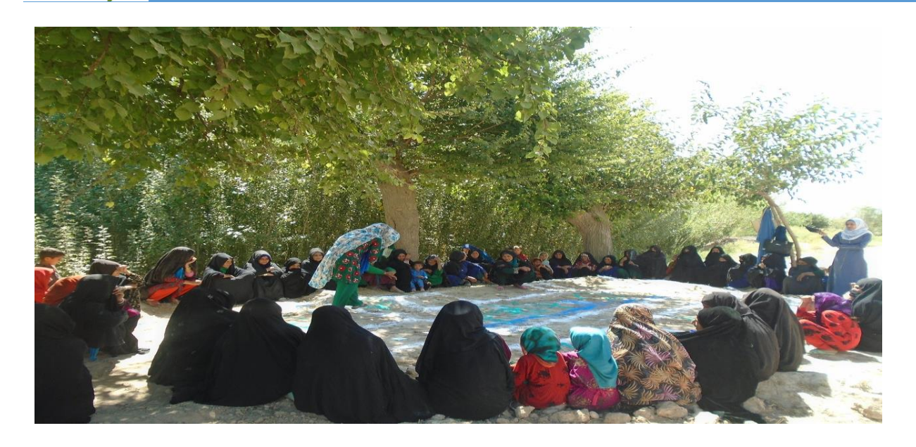
The Strengthening and Scaling-up Malaria Prevention and Case Management to improve Health Status in Afghanistan

Through this project (Jan 2018 to March 2019) ,ORCD has covered 962377 population through 112 HFs and 710 HPs -by implementation of case management at health facilities, communities and provision of training for health facilities staff, CHSs/CHWs, and distribution of LLINs through continuous distribution during ANC visit.