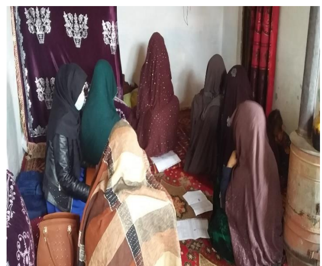
Figure 2 : Referring females with psychosocial needs to the respected clinic in Nawabad Baghlan-e-Markazi