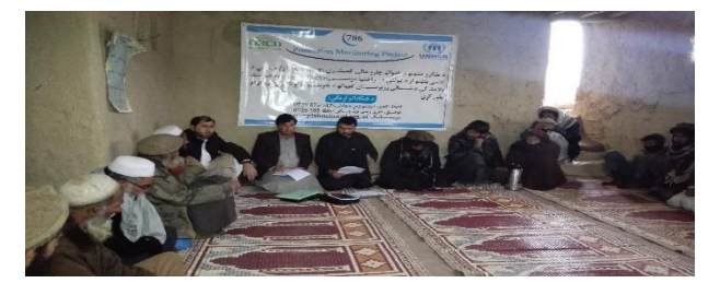
both target provinces and achieved the target discussion with Pakistani Refugees in Gullan Refugee Camp

In 2019 ORCD carried out protection monitoring of refugees from Waziristan Agency of Pakistan in Khost and Paktika provinces using standard processes and tools provided by UNHCR. Through this intervention, ORCD was able to reach out over 20,000 women, men, boys and girls of both refugee and host communities in 60RCD protection monitoring team during conducting Focus Group set forth with a 100% success rate.