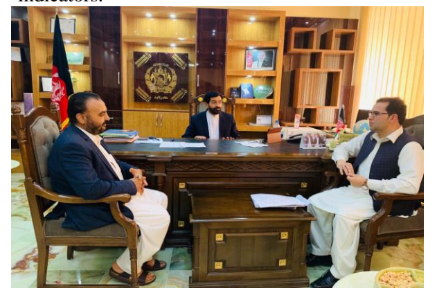
Figure 3 Meeting with Helmand Governor regarding PPP Project Activities in Helmand