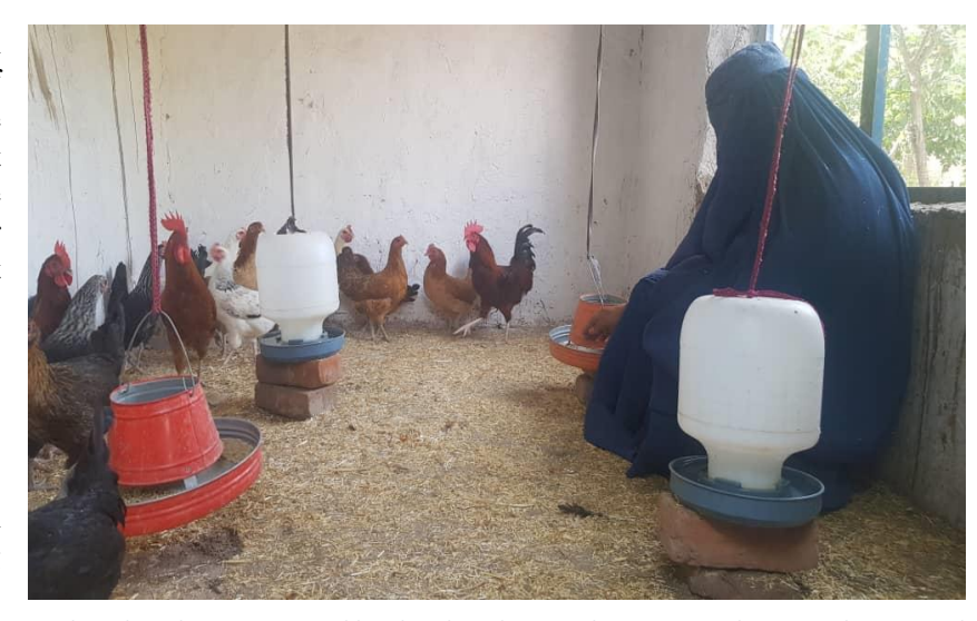
Backyard Poultry Farm in Surkhrod with 25 hens and 5 roosters. The owner has started breeding pullets at home for sustainability of her farm

Through this project, ORCD was able to mobilize all 32 targeted communities against cultivation, processing, trafficking and use of narcotics by carrying out awareness campaigns about harms of drugs to community members and its harmful impacts at national