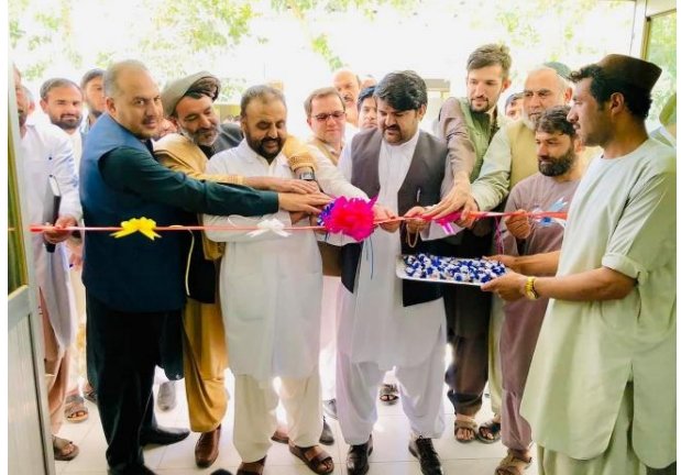
Figure 1 Inauguration of Helmand New PHCC Meeting Hall

All incentives paid to PHPs were calculated based on achievement of proxy indicators against baseline indicators. Figure 1 Inauguration Meeting Hall