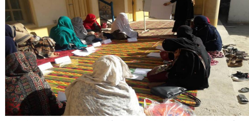
Cluster leadership training conducted for cluster member in Majbor Abad village of Jalalabad city

initial refresher and trainings about CBSG manual, leadership skills, CBSG accounting, CBSG membership as well as CBSG clustering, cluster subcommittees governance committee. grievances redressal mechanisms, rapid market assessment and other relevant topics that were conducted by dedicated trainers AKF of in Baghlan and Nangarhar provinces.