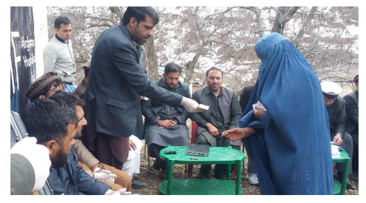
4Beneficiary receiving cash-based winterization assistance in Nuristan province

Winterization Strategy 2019-2020, there are a total 1781 persons in Nuristan and a total 517 persons in Paktika were desperately in direct need of the winterization assistance. Out of this baseline, a total 600 families in Parun of Nuristan and 400 families in Sharana, Urgun and Sarobi of Paktika will be targeted. These targeted households received $ 200 in two equal instalments. The beneficiaries used the assisted amount for procuring means to cope with winter cold such as firewood, blankets, stoves and warm cloths.