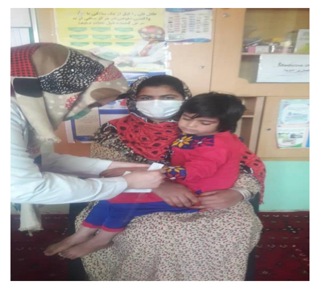
Figure 1: WPC Heatlh worker examing a sick client in Baghlan center

WPC was operated in close coordination with relevant stakeholders. WPC and DoWA staff were provided capacity building around relevant topics. Throughout 2019, WPC in Baghlan accommodated 119 women accompanied by 27 children who were provided psychosocial counselling, legal aid, literacy trainings and vocational trainings aimed at women economic empowerment. Out of the entire number of clients, cases of 89 clients were resolved through mediation and court, were discharged from WPC and reintegrated to their families.