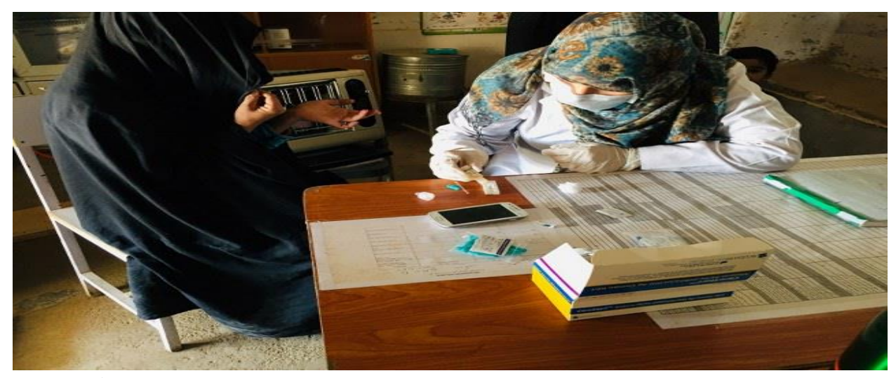
Figure 2: Malaria case management at HF

During the year 2018, ORCD performed 107 effective supervision and monitoring of the project sites and activities, action plans were made and follow-up were done to ensure that the gaps are filled and performance is improved. Also 460 community awareness session conducted in Sarepul and Zabul Provinces, Joint monitoring conducted with UNDP, PPHD, NMLCP, PMLCP and other relevant stakeholders as well. ORCD maintained good coordination with all relevant stockholders at national and provincial level. Also provincial FPs received MLIS Training and the system has been applied at the HFs of Zabul and Sare Pul Provinces.