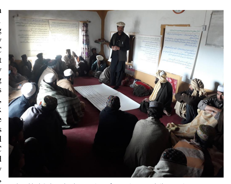
Yahya khel Gulowal subcommittee formation In Paktika province

In 2019, ORCD continued facilitation of Citizens' Charter in 92 of 181 contracted communities by engaging target communities in community profiling, CDC elections, registration and bank account opening, development of community development plans, mapping community resources, social patterns and women mobility. Additionally, baseline institutional maturity index assessments of all elected CDCs were conducted, Community Score Cards were implemented and all essential trainings i.e. CDC bylaws, CDC office-bearers roles and responsibilities, community procurements, financial management, project cycle management, community score card and etc.