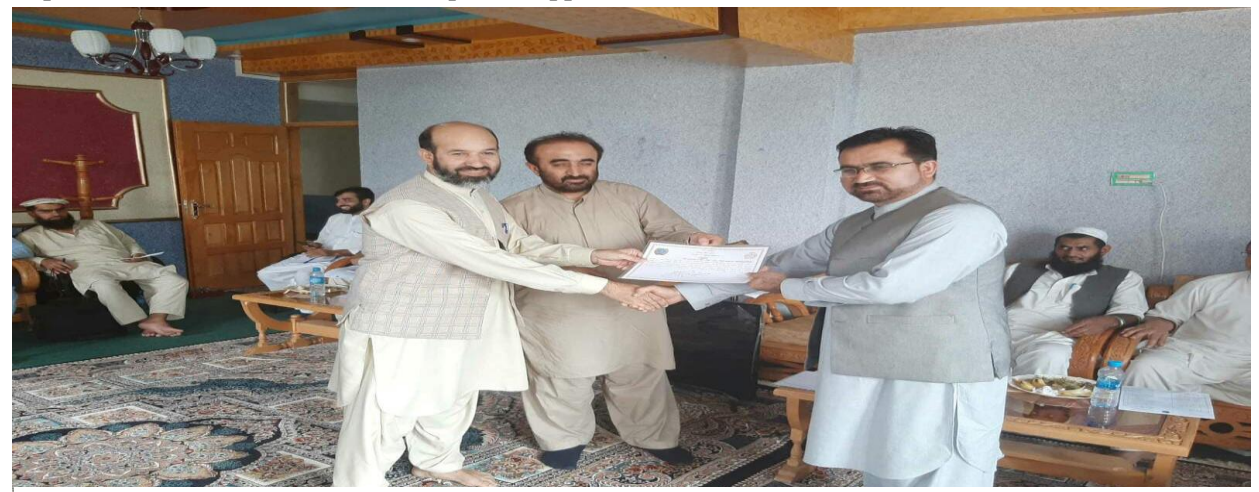
Figure 1 : Our Deputy Project Director for Kunar BPHS/EPHS Project is appreciated by the Provincial Public Health Directorate of Kunar Province for demonstrating excellent management of the project.

As per the work plan of Sehatmandi project, HealthNet TPO/ORCD conducted assessment with the concern of the recruiting, health facilities physical condition, training needs, renovation, medical and non-medical needs, management of the HFs and delivery of health services. In the perspective of the findings of the assessment, a comprehensive plan had been formulated by HealthNet TPO/ORCD since a better imp lementation needed the entire required supplies were delivered to HFs.