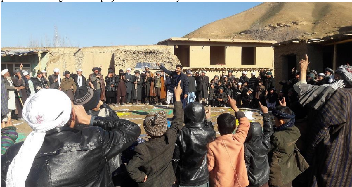
Figure 1 : CLTS Triggering in Saripul Sozma Qala District

In partnership with FHI360, ORCD embarked on implementation of Community Led Total Sanitation in SarePul and Zabul provinces in April 2018 and ended in April 14, 2019. The project aims to mobilize and sensitize communities to achieve an open defectaion free (ODF) villages in all target districts of the target provinces. During the life of project 138 community certified as ODF.