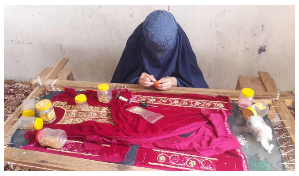
A CBSG member generating livelihood income form the loan she received form CBSG saving purposes committee

All 405 members of 25 CBSGs the established in Jalal Abad have held meetings regularly on weekly basis, have made regular savings and have discussed issues around their roles and responsibilities, norms, potential business ideas and etc. Some of CBSGs have also extended loans to members for various ranging from