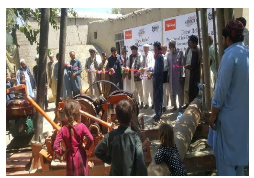
Figure 1 : Construction of Deep wells in Nangarhar Behsod district

In Partnership with penny appeal the projected started in April 2019 and ended in Aug 2019. Totally 25 Deep wells constructed in Nangarhar and Baghlan provinces, The direct project beneficiaries are 375 families making 2,625 individuals objective of the project is to increase access of poor and the most venerable people (women and children) to the safe and clean water in order to prevent the transmission of water borne diseases in the targeted communities.