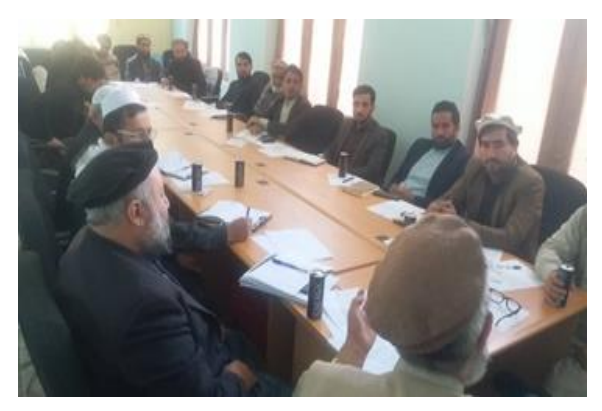
Figure 3 PHCC Meeting in Nuristan PPHD Office