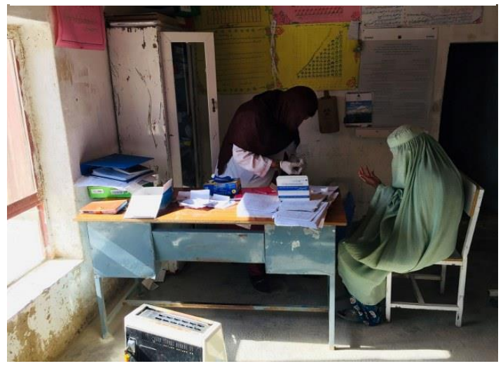
Figure 1: Malaria case management at HF

suspected cases were tested by RDT and microscopy and 237 positive cases were treated by health care providers and Community Health Workers in mentioned provinces. Throughout this year, ORCD conducted the RDT and NTG trainings for health facilities staff, CHSs and CHWs in Sarepul and Zabul provinces. Conducted trainings enabled invited participants to perform effective case management and diagnose of Malaria cases both at health facilities and community level. 120 health practitioners were trained on RDTs