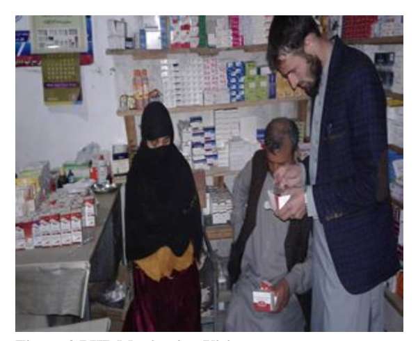
Figure 2 PHP Monitoring Visit