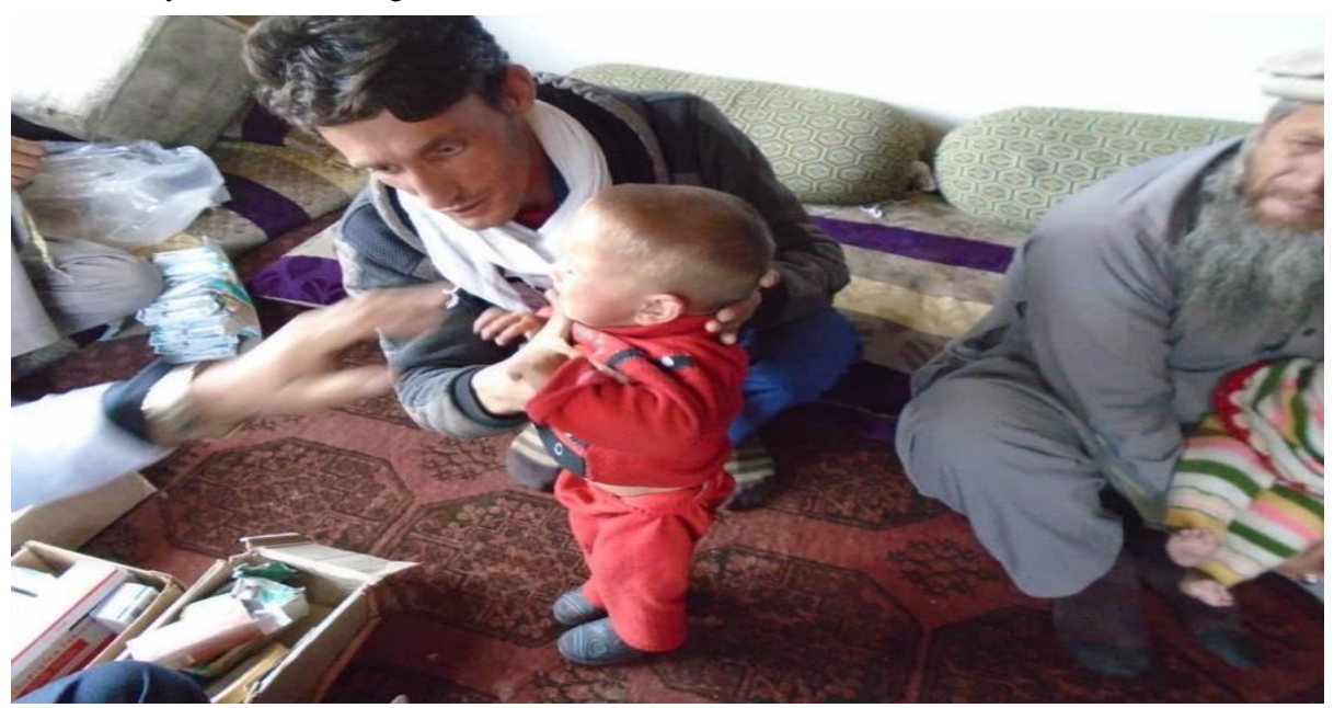
Figure 2: Examining Patient by Doctor

Totally, 3635 under 5 children were screened for malnutrition, 1094 children were referred for treatment, 523 children were enrolled in MAM program, IYCF counseling were done to 10,576 PLWs from January to the end of august 2019.