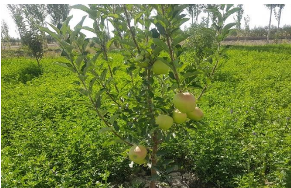
Distribution process of animal husbandry management and Fruit bearing by saplings distributed through BADILL in dairy processing inputs in Nangarhar