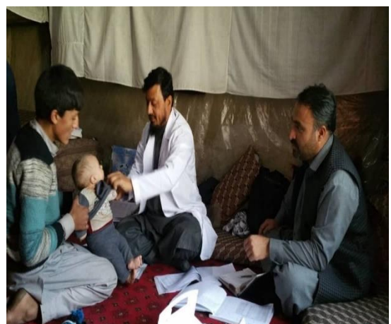
Figure 2: Measuring MUAC of Baby

In the view of this, the nutrition mobile teams tackled both supply side and demand side factors. On demand side aspect, they strengthened community-based nutrition interventions i.e. increased case