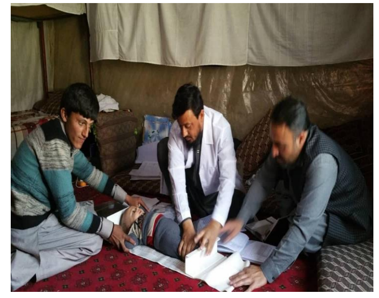
Figure 1 : Recording Z-Score for Malnutrition baby

ORCD deployed staff as per guidelines introduced by MoPH for three mobile nutrition teams (1 midwife, nutrition officer and support staff) and one emergency mobile health team (1 MD, Midwife, vaccinator and support staff) serving underserved areas in the districts (Paroon, Wama and Nurgram). The mobile nutrition teams worked in the areas beyond the reach of the existing health facilities as part of nutrition mobile activity. The mobile teams were greatly needed because the existing BPHS did not have any mobile health team while there was drought