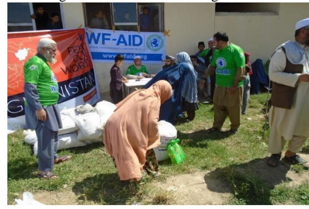
Figure 2: Ramadhan food packages distribution in Baghlan