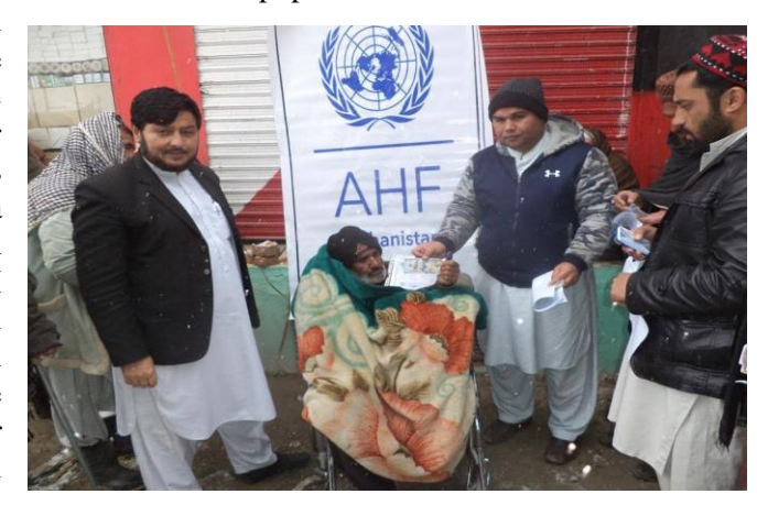
Beneficiary receiving cash assistance in Paktika province

provinces. The contract agreement started November 15, 2019 to May 14, 2020. The proposed project which is in line with the Humanitarian Response Plan (HRP) for 2019 (addressing SO1 and SO2) was implemented in Nuristan & Paktika provinces which both of them are included in the priority 1 provinces of the ES/NFI cluster as highlighted in Joint Winterization Response Strategy. The project's overall objective was to improve well-being of the target vulnerable people to meet their immediate survival needs winterization assistance so that they can withstand harsh winter. The project directly contributed to the strategic objective 1 and 2 of