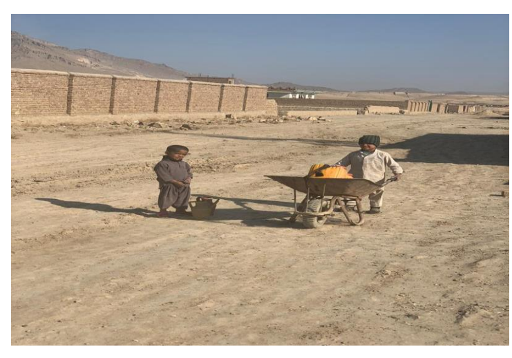
Photo depicting pre-project condition of beneficiaries as small kids used to fetch water in wheelbarrow from more than one KM walk

identified most needed community this Thirst Relief project. Selection of Butkhak village was done as the area hosted many IDPs and Refugee Returnees household who were in the dire need of safe qualified drinking water. Α construction company selected as competitive part of a bidding process, ORCD embarked implementation of construction of pipe-scheme (water supply network). The drilling of the deep well began with 16" diameter, 120 m depth and construction of RCC water tank with capacity holding 15,000 litres of water at a time. Solar panels of 1,400 watts