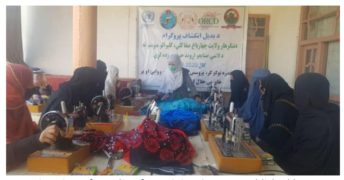
An action view of Handicrafts Training Center established by BADILL in Nangarhar province

Through Animal Husbandry Management and Dairy Processing component of this project, capacity of 505 farmer families was enhanced on best practices of animal husbandry management, dairy value-added