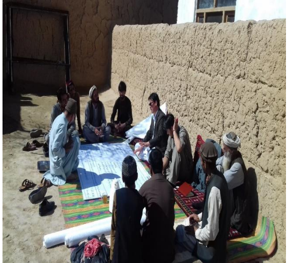
Figure 1 : Reviewing Khwaja Alwan community's CDC plan