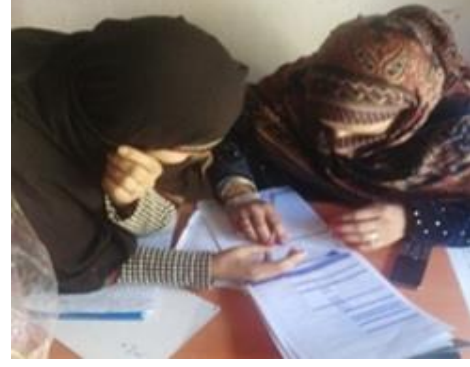
Figure 1: PHP Monitoring Visit

Additionally, monthly incentives were paid to Private Health Practitioners based on their achievements.