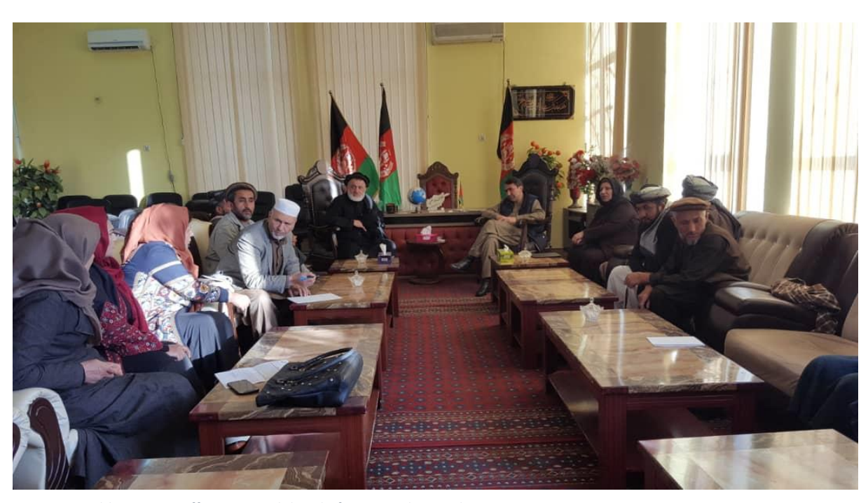
Figure 2 Baghlan WPC staff meting with head of provincial councils